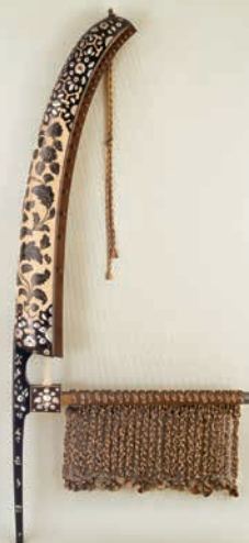
Kugo Harp with Mother-of-Pearl Sound Box