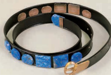
Leather Belt with Lapis Lazuli Ornament