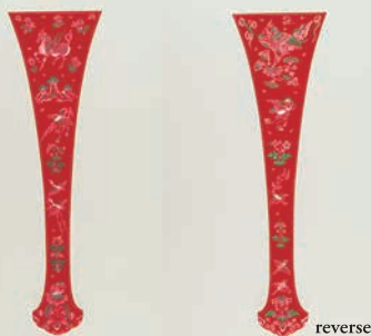
Red-Stained Ivory Bachi Plectrums with Bachiru Carved Designs

The Shosoin Treasures originated with Empress Komyo's bequest of those objects that Emperor Shomu had been fond of during his lifetime to the Great Buddha at Todaiji Temple in 756. The Shosoin is even referred to as the "Eastern End of the Silk Road", and the objects richly reflect the cultural exchange between East and West Asia at the time. They are recognized around the world as miracles due to their remarkable state of preservation. Treasures that are over 1,300 years old are extremely fragile. When Emperor Meiji visited Nara in 1877 and inspected the Shosoin Treasures, he found that many of them were damaged. According to "The Emperor Meiji Chronicles", the Emperor ordered the organization of these items as well as the repair of particularly severely damaged musical instruments. This is regarded as the first step in restoring the Shosoin Treasures and creating reproductions, an effort that continues to the present day. This exhibition explains the importance of preserving and passing on treasures, as well as the techniques used to reproduce them and the most recent research findings obtained through the process.