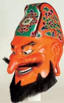
Gigaku Mask of Suiko-o (Foreign King)