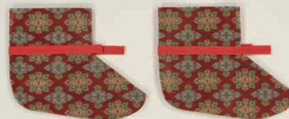
Pair of Socks for Fufuki (piper) Player of Kuregaku (dance and music)