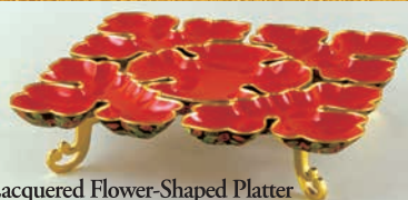
Lacquered Flower-Shaped Platter with Painted Decoration