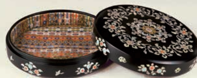
Round box with Mother-of-Pearl Decoration for the Leather Belt

All works on display are reproductions of treasures. Some works will be changed during the exhibition.