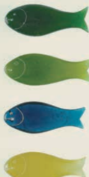
Glass Fish-Shaped Ornaments